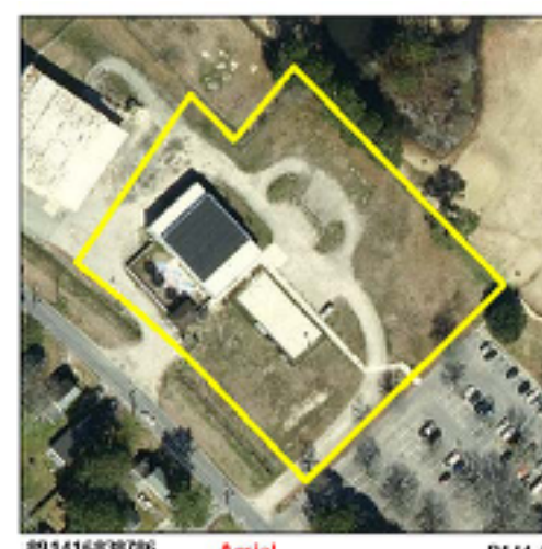
891416838786 Aerial P144-1A

Total Acres: 2.35 Total Land Value: $418200