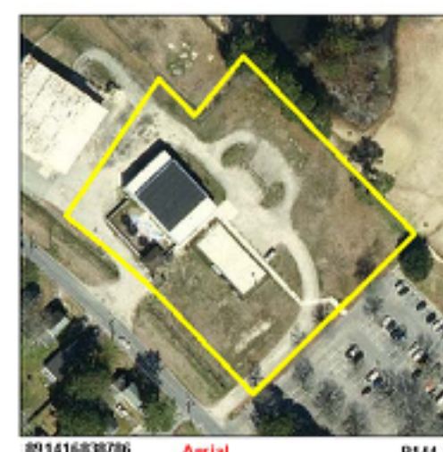
891416838786 Aerial P144-1A

Total Acres: 2.35 Total Land Value: $418200