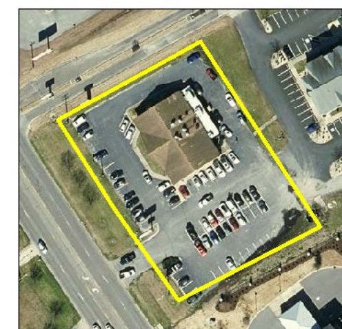
891310255717 Aerial P89-33E